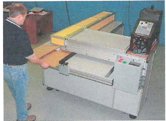
INSERT AND GLUE BOX