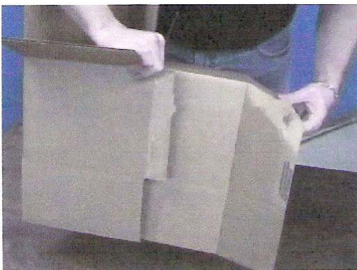
PAPER FIBERS TEAR AFTER FIVE SECONDS