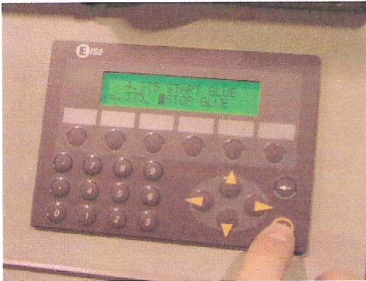
ENTER START AND STOP DIMENSIONS FOR GLUE

DESIGNED TO COMPLIMENT THE ABM BOX MACHINES REQUIRES ONLY 8 FT. X 9 FT. OF FLOOR SPACE COMPLETELY ENCLOSED FOR SAFETY FIELD PROVEN GLUE SYSTEM BUILT-IN CASTERS FOR MOBILITY GLUES INSIDE OR OUTSIDE GLUE FLAPS USES LOW TEMPERATURE HOT MELT COMPRESSION ROLLERS HOLD FLAP DURING SET TIME